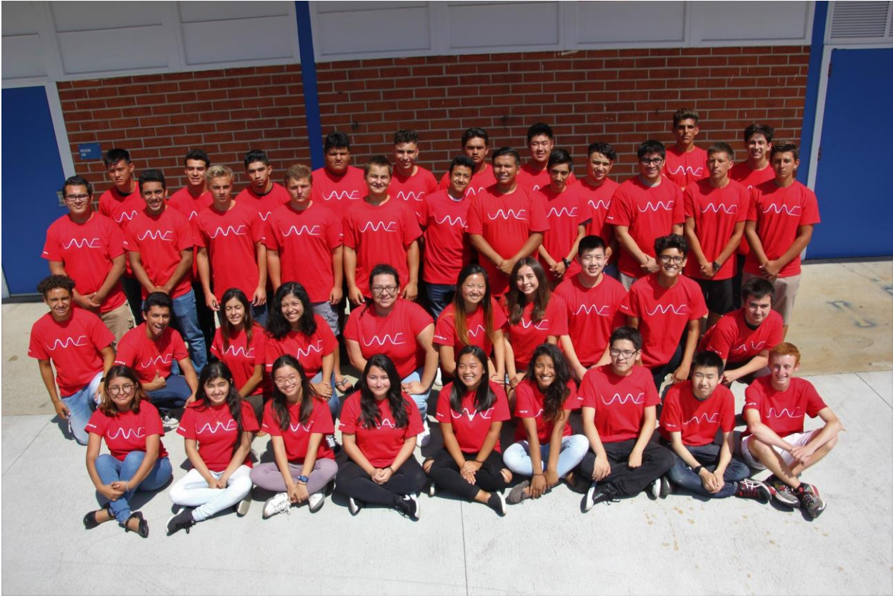
Engineering Class of 2017-2018